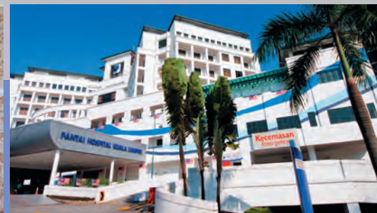
PANTAI AND GLENEAGLES GROUP OF HOSPITALS p.17