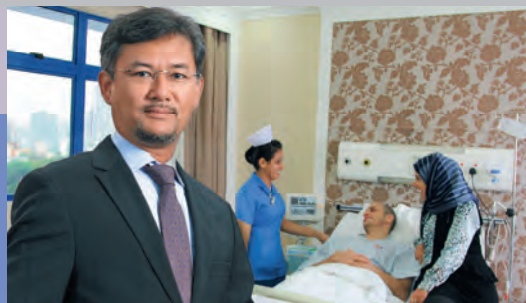
KPJ HEALTHCARE BHD Malaysia's largest healthcare group p.56