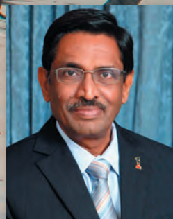
Y.B. DATUK SERI DR. S. SUBRAMANIAM MINISTER OF HEALTH